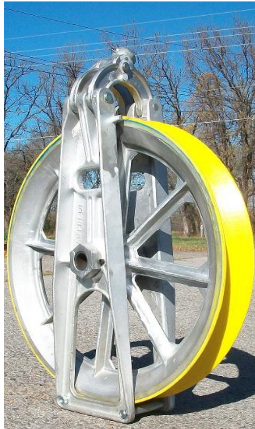
MODEL NO. A1428C

A choice of conductive-type Neoprene liner, or Urethane liner is offered, and is extra.