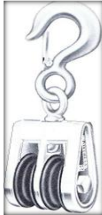
Double with No.5 Hook Less Becket