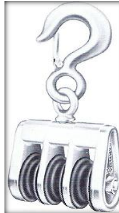
Triple with No.6 Hook Less Becket