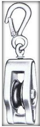
Single with No. 3 Hook and Becket

Constructed with forged steel fittings, aluminum alloy frames, fiber-plastic sheaves that are practically unbreakable, and large axles with high-quality bearings. A choice of self-lubricating bronze bearings, or ball bearings is offered.