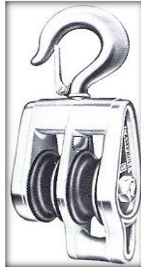
Double with No.5 Hook and Becket